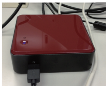
Cryptobox (8 cm x 8 cm, 500 g)