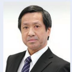
Director, Center for Data Science

In recent years, the fourth industrial revolution based on AI, Big Data and IoT has changed society dramatically. In this context, data science is attracting attention as an interdisciplinary science for extracting and utilizing valuable information from big data. The training of data scientists with advanced technology expertise is an urgent issue. In response to these social needs, Tokyo University of Science has established a Center for Data Science. By leveraging the strengths of this university, which has faculties of science, engineering, pharmacy, biomedical science, management and research institutes, we will improve education and research in the field of data science and promote joint research and social contributions by providing platforms that integrate research in their respective specialized areas with data.