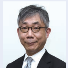
Tokyo University of Science, Vice President and Organization for Research Advancement President

This organization presently has four centers or institutes: University Research Administration Center, Research Institute for Science and Technology, Research Institute for Biomedical Sciences and Research Equipment Center. And now a new Center for Data Science has been established to improve education and research in the data sciences sector and contribute to the future society and economy.