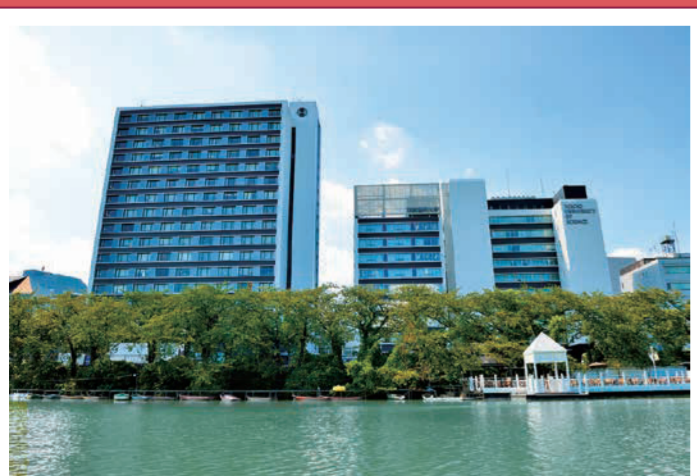
Kagurazaka Campus 1-3 Kagurazaka, Shinjuku-ku, Tokyo 162-8601 From Tokyo Station : about 10 mins by train