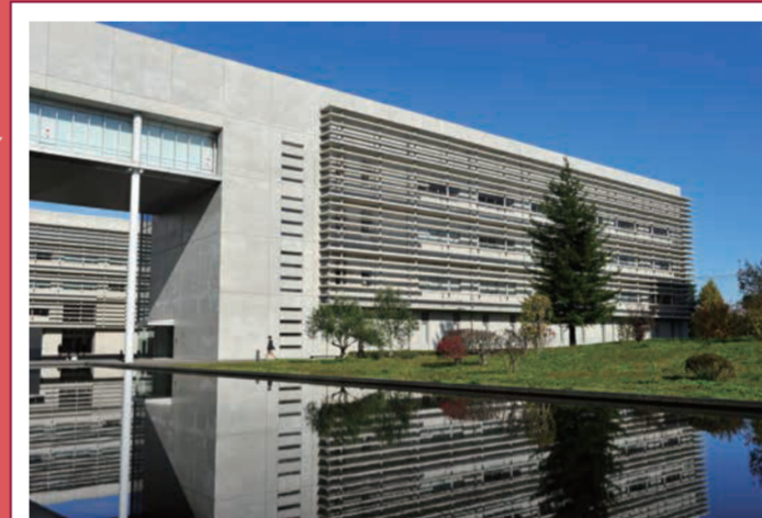
Noda Campus 2641 Yamazaki, Noda-shi, Chiba 278-8510 From Tokyo Station : about 41 mins by train