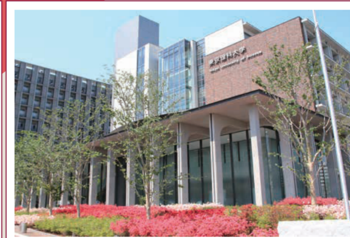
Katsushika Campus 6-3-1 Niijuku, Katsushika-ku, Tokyo 125-8585 From Tokyo Station : about 33 mins by train